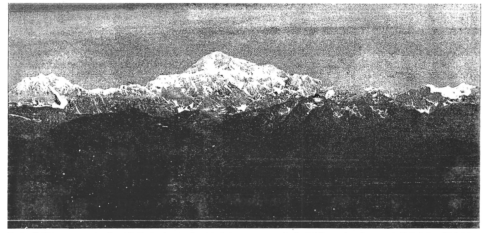
The lead HART crew approaches Mount McKinely, where two Spanish climbers were rescued by the HART crews from Company B, 4th Battalion, 123 Aviation.