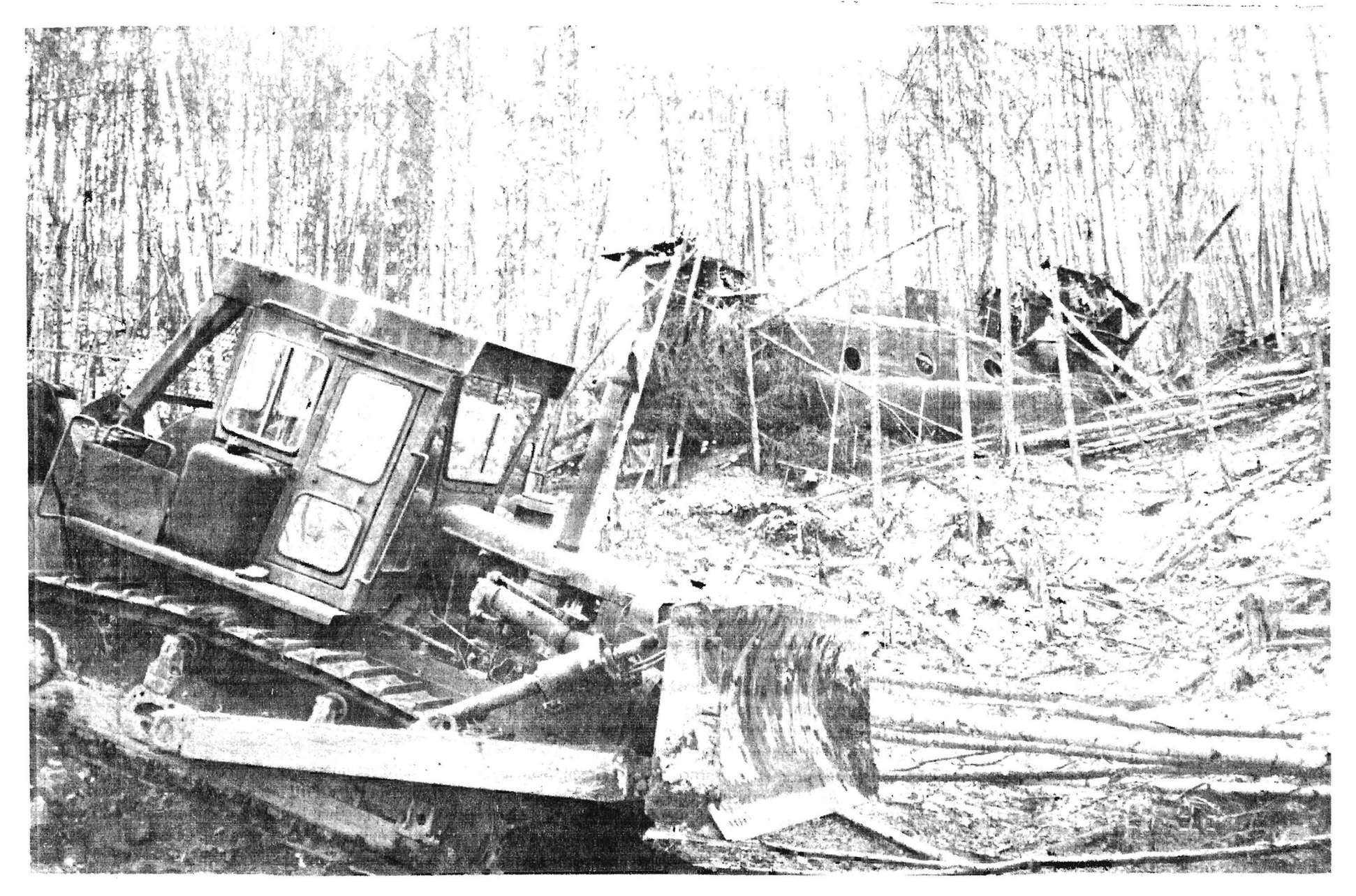
Pfc. Leon Orange uses a D-7G bulldozer to clear the extraction site for the Chinook helicopter.

When the engineers finished clearing more than an acre of woodland, the remains of the Chinook were extracted in two sections.